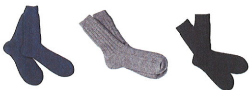
Navy, grey or black socks (not white)