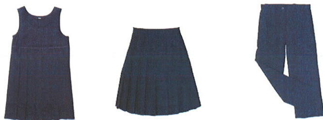
Navy pinafore, skirt or trousers